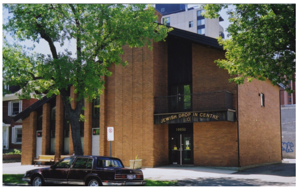
1993: the new Jewish Seniors' Centre building.