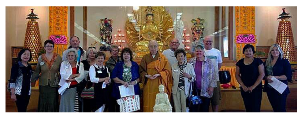
Visit to Edmonton Buddhist temple, 2014.